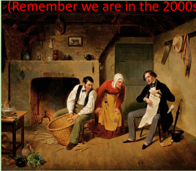
Painting from 1850s